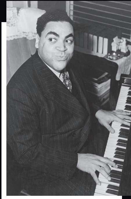
Fats Waller, 1938

Fats was an excellent pianist, usually considered one of the very best in the stride style, but his songwriting and lovable, roguish stage personality