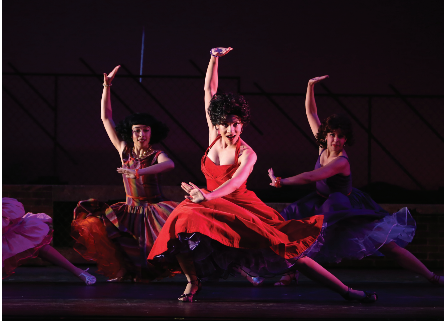
West Side Story.