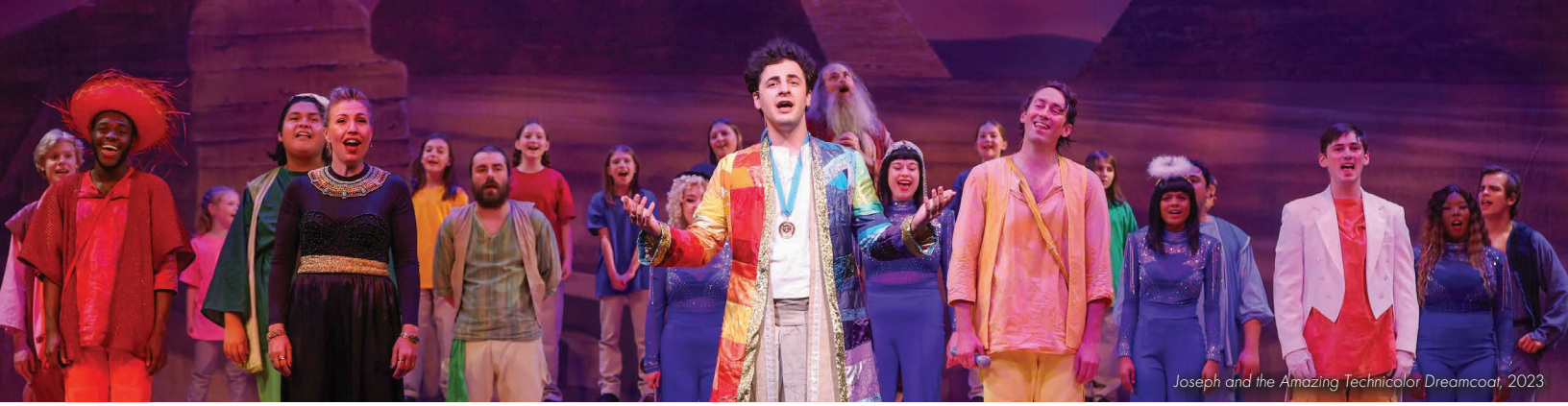
Joseph and the Amazing Technicolor Dreamcoat, 2023